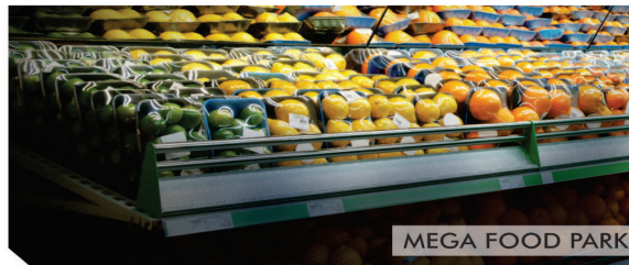
MEGA FOOD PARK