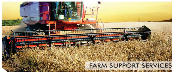
FARM SUPPORT SERVICES