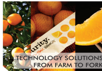
TECHNOLOGY SOLUTIONS FROM FARM TO FORK