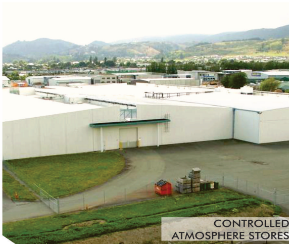
CONTROLLED ATMOSPHERE STORES